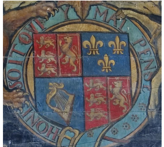
Close-up of the shield

Heraldically speaking, the board shows an achievement which consists of the following elements.