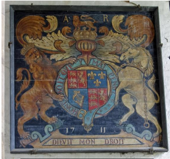
Overall view of the board

I thought that you might like a change of topic after a fairly heavy bit of history last time, so I am going to talk about the Royal Coat of Arms that hangs above the south door.